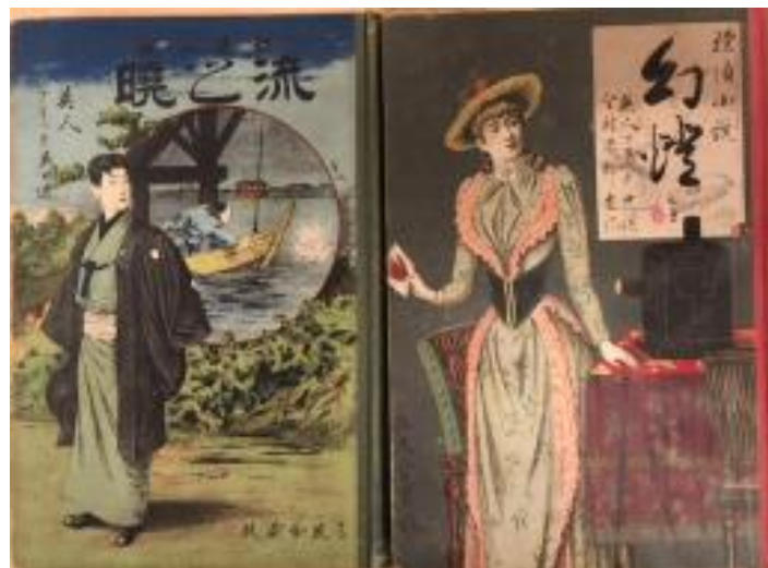
Left: Nagare no akatsuki nla.cat-vn7582632 , Right: Gento nla.cat-vn7582631

Black also published six or seven stenographic novels. "Gento" (right hand side) is known as one of the earliest detective stories to use fingerprint verification to solve a mystery.