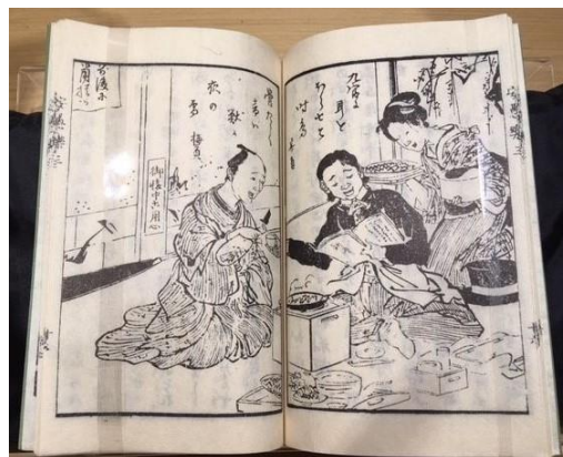
Aguranebe, reprinted in 1968, nla.cat-vn1494540

It shows that the waitress and waiter are wearing traditional clothing while the customer, in Western hairstyle and clothing, enjoys reading the news over a pot of beef. The illustration highlights the customer's way of putting on airs of civilisation and enlightenment.